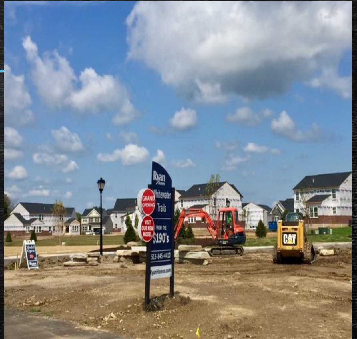
WW Trails – 300+ more homes coming!