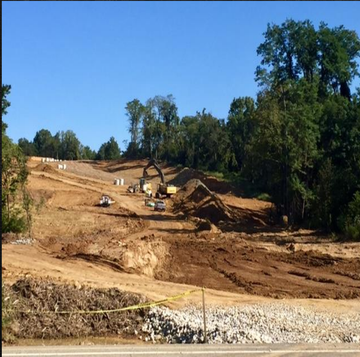
Fort Scott – 200+ more homes coming!