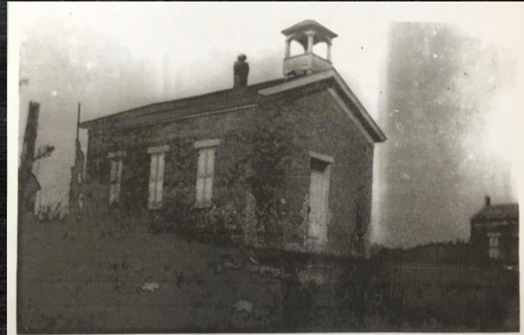
The Whitewater Schoolhouse on Dry Fork Creek Road 1897