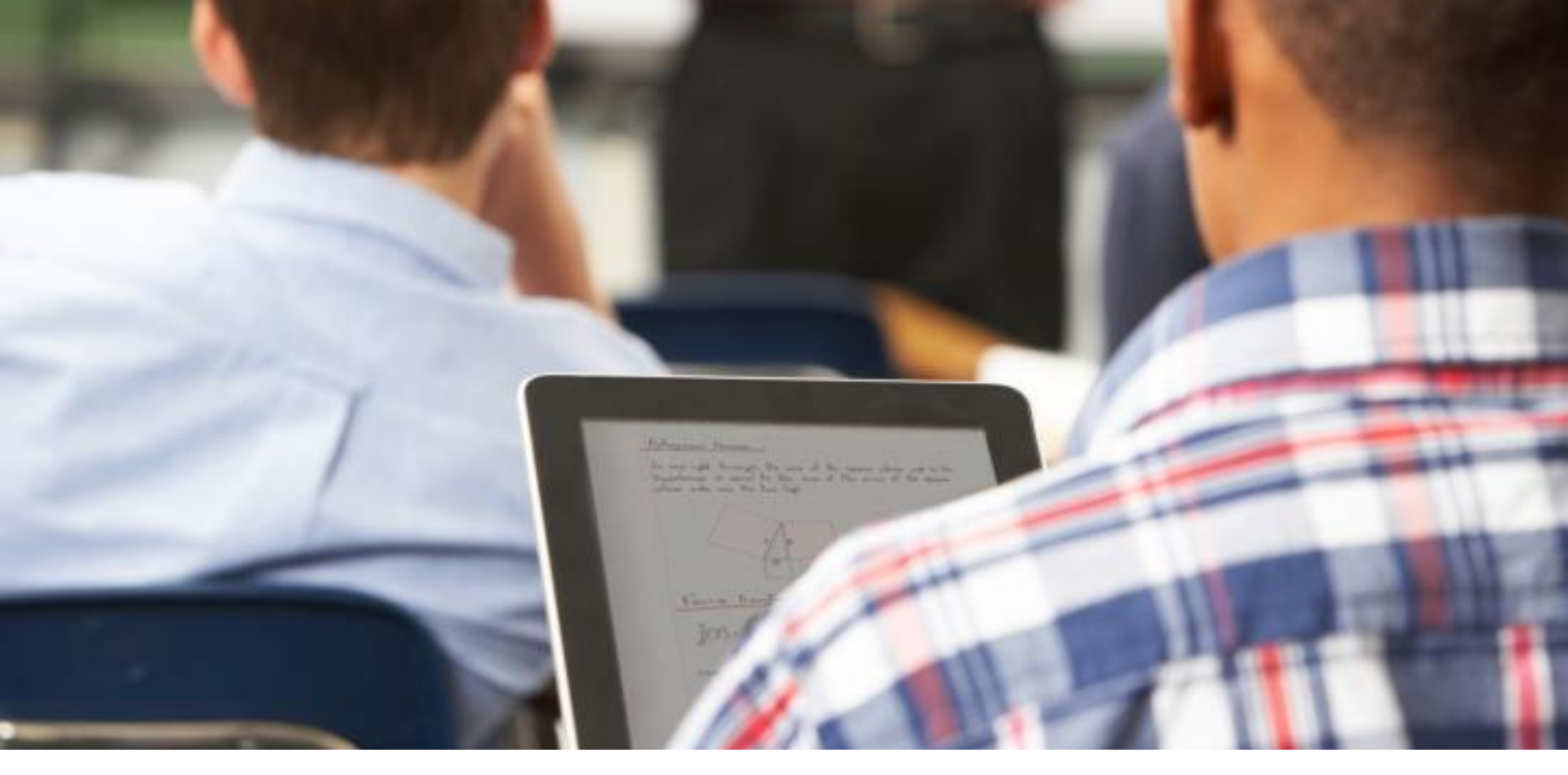
College-readiness may be determined by placement tests or ACT.